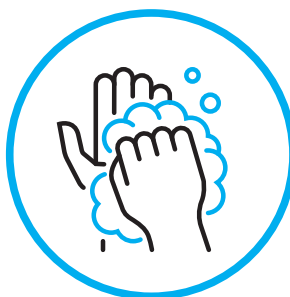
Hygiene and cleaning