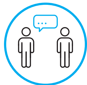
Wellbeing of staff and customers